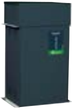
Box (Square) Type 440V Capacitors