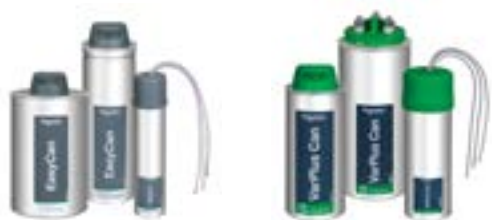
Can (Cylindrical) Type 440V Capacitors